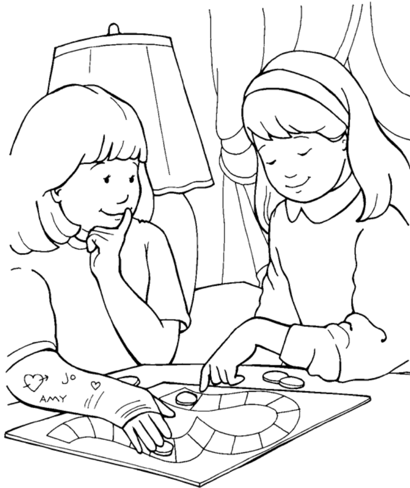
Showing Kindness Toward Others

Each number represents a letter of the alphabet. Substitute the correct letter for the numbers to reveal the coded words.