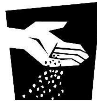
Mustard Seed Faith