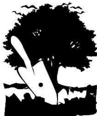
Mustard Seed Faith

Copyright © Sermons4Kids, Inc. May be reproduced for Ministry Use