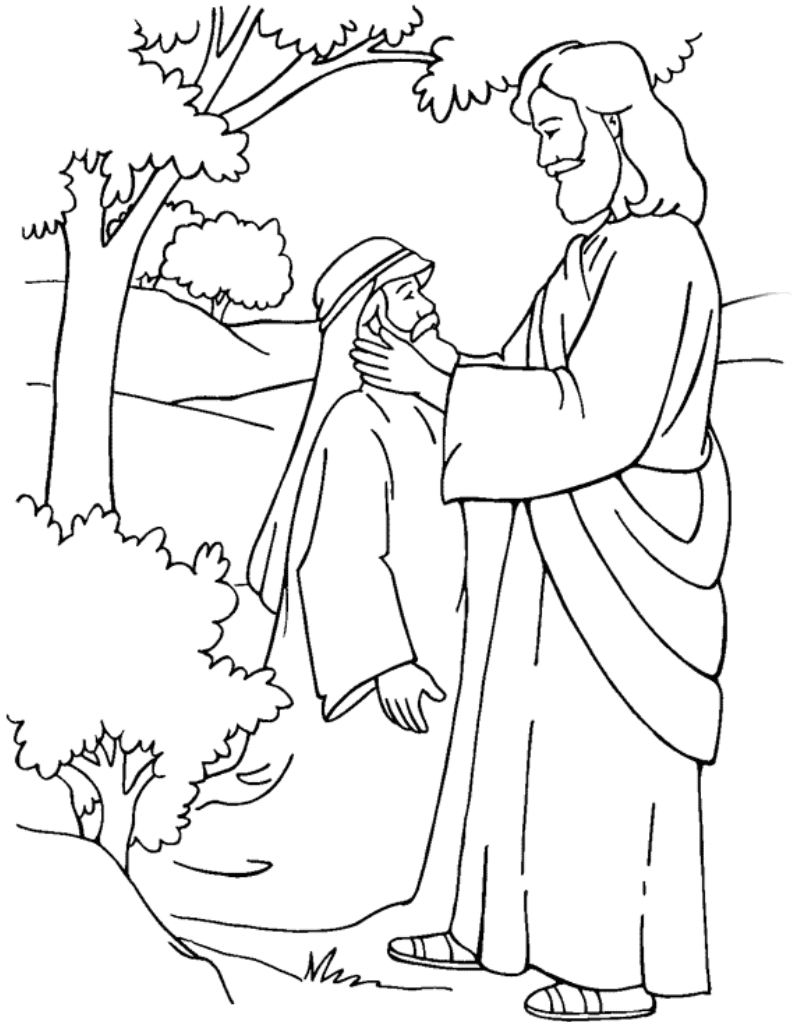
Jesus Heals a Deaf Man Mark 7:31-37

Each number represents a letter of the alphabet. Substitute the correct letter for the numbers to reveal the words.