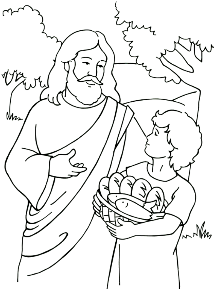
Jesus Feeds the 5000