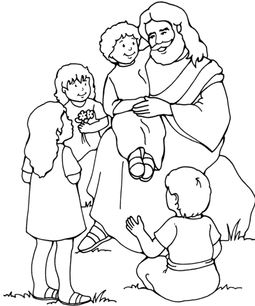
Jesus and the Children

Each number represents a letter of the alphabet. Substitute the correct letter for the numbers to reveal the coded words.