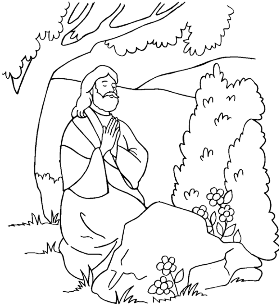
Jesus Prays for His Disciples

From Thru-the-Bible Coloring Pages for Ages 4-8. © 1986,1988 Standard Publishing. Used by permission. Reproducible Coloring Books may be purchased from Standard Publishing, www.standardpub.com, 1-800-543-1301.