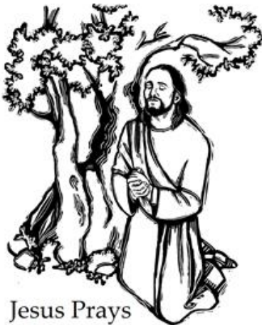
Jesus Prays for his disciples.

Copyright © Sermons4Kids, Inc. May be reproduced for Ministry Use