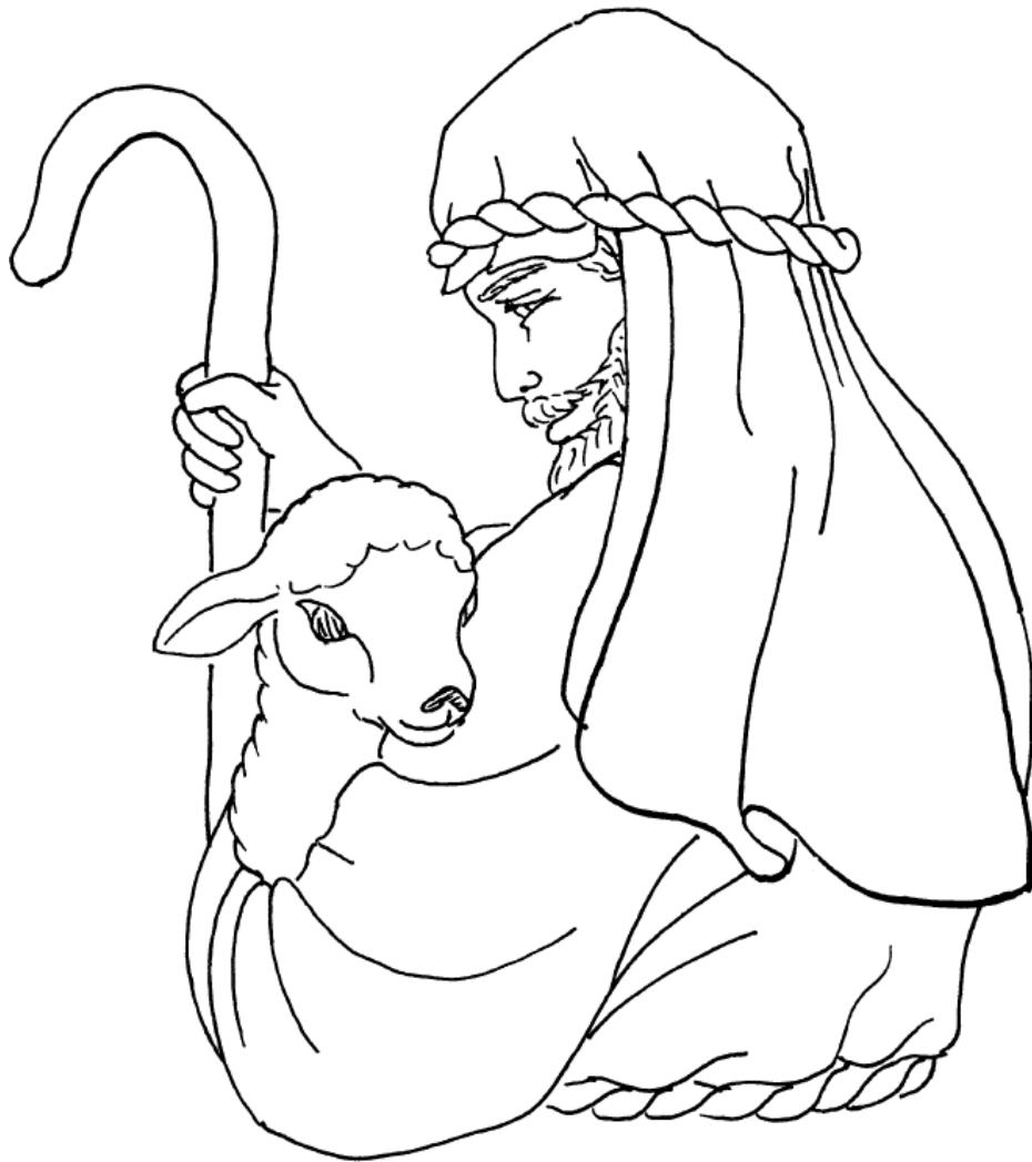
The Good Shepherd