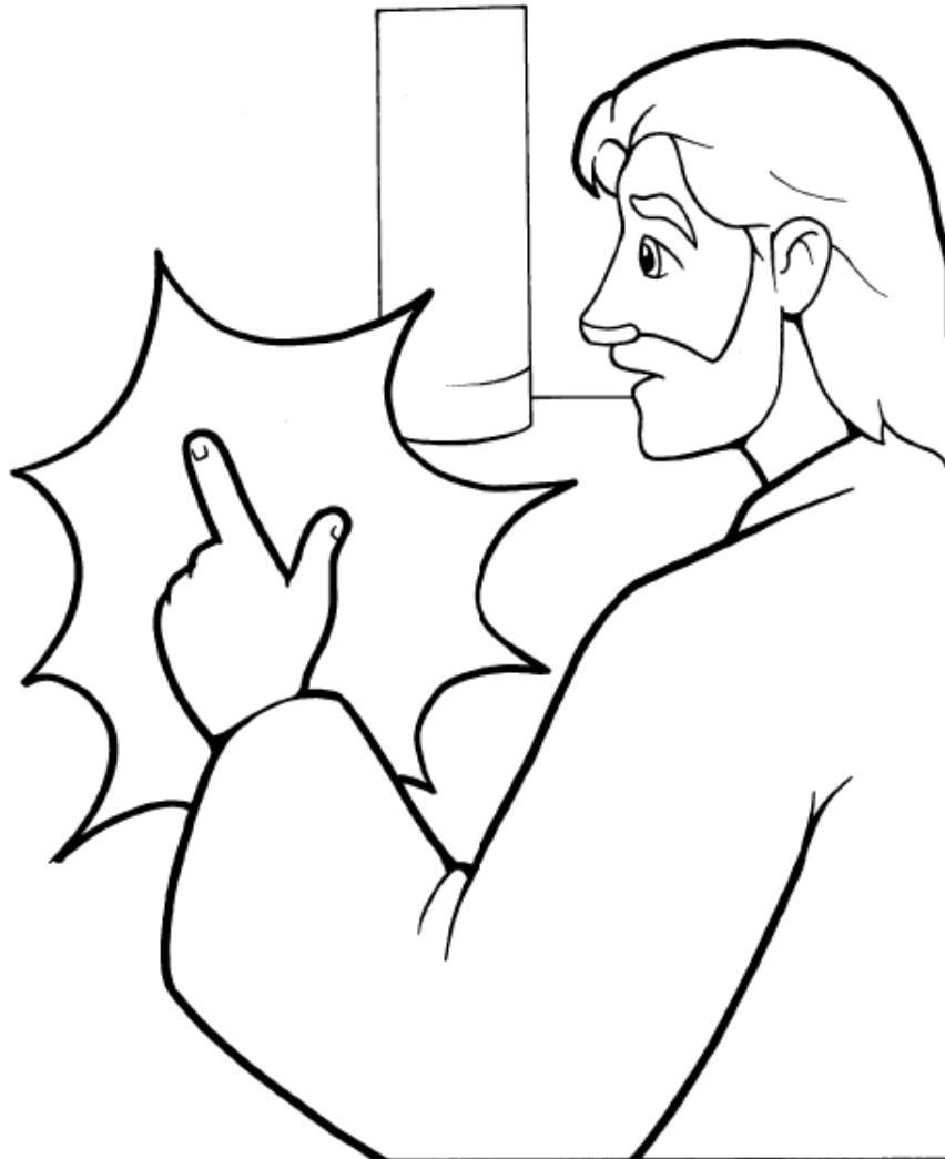
Jesus Appears to the Disciples

Copyright © CalvaryCurriculum.com Used by Permission