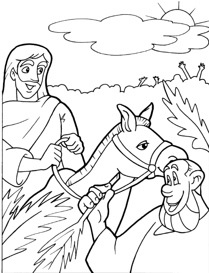
The Triumphal Entry

Can you help Jesus find the way through the streets of Jerusalem to the temple?