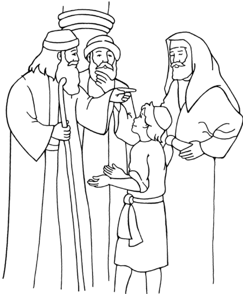
Jesus in the Temple Luke 2

Can you help Mary and Joseph find Jesus in the Temple?