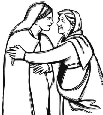
Mary Visits Elizabeth

Copyright © Sermons4Kids, Inc. May be reproduced for Ministry Use