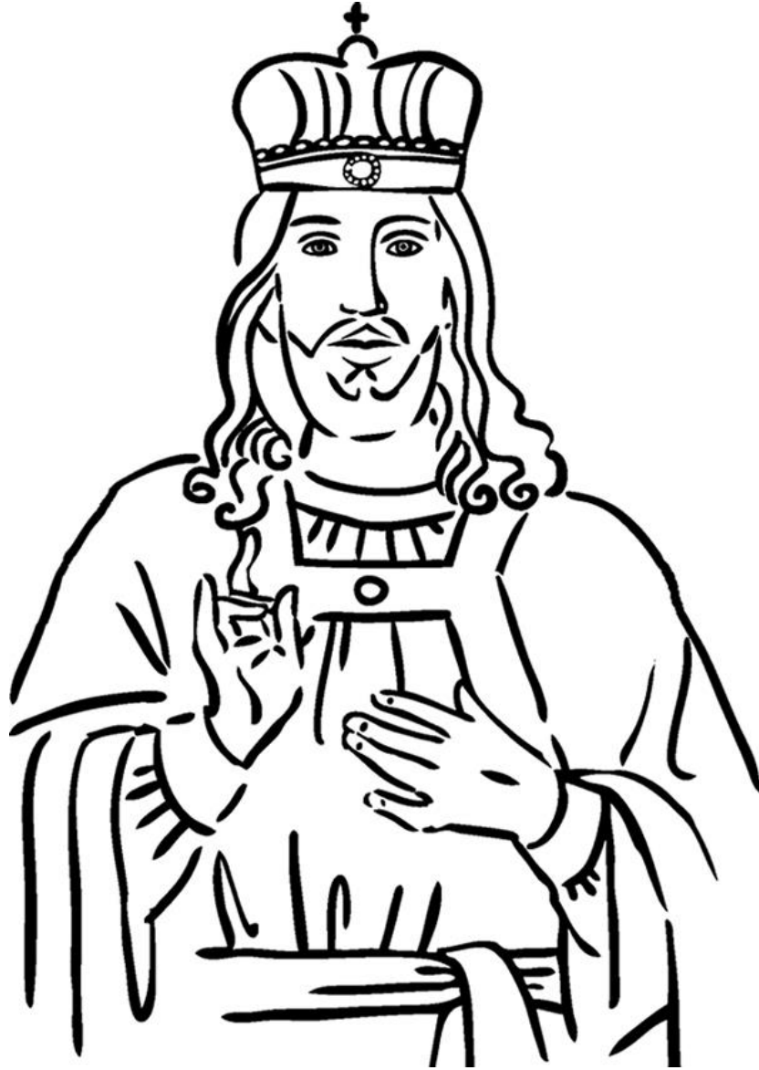
Christ the King John 18:33-37