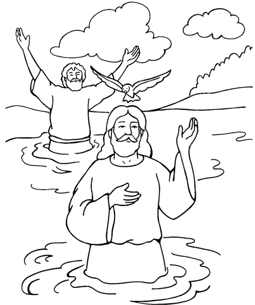
John Baptizes Jesus Matthew 3, Mark 1, Luke 3