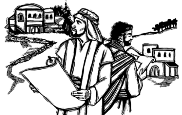
The Wise and Foolish Builders Matthew 7:24-27